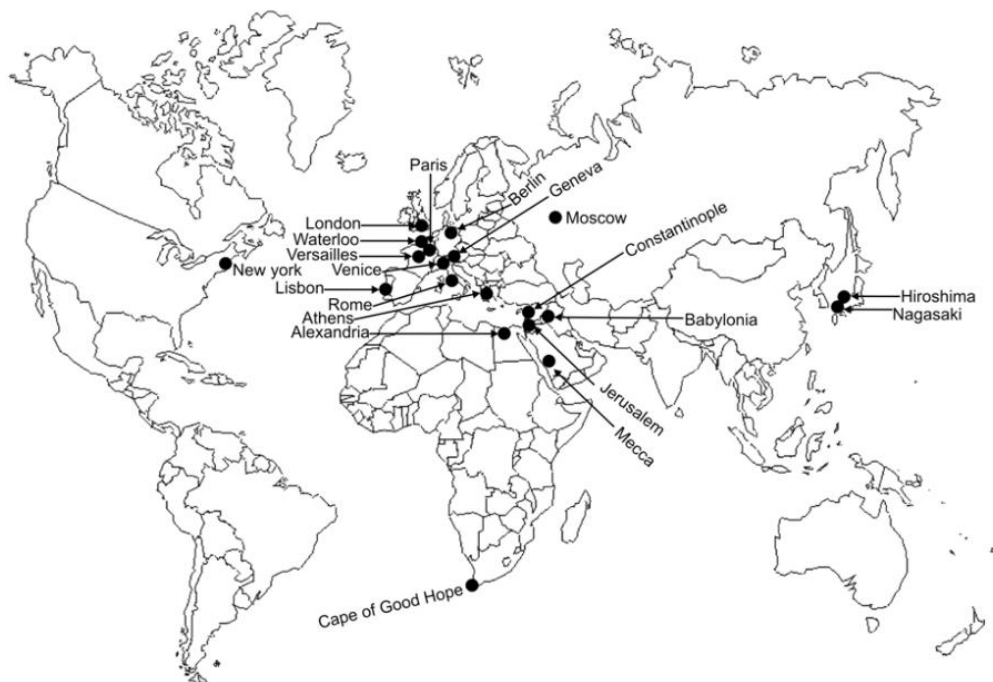
MAP WORK - PLACES OF WORLD IMPORTANCE